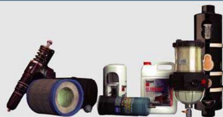
500 hours genset spare parts