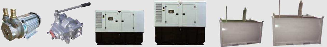
Auto filling fuel pump